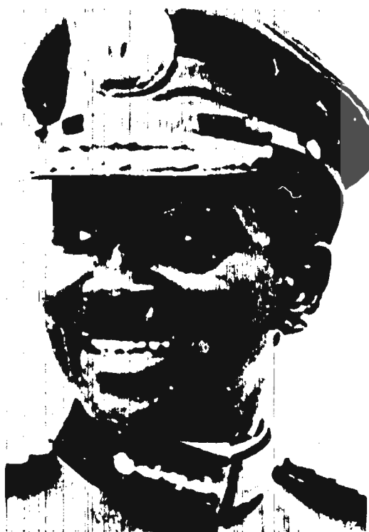
Major General Yakubu Gowon Head of Federal Military Government

for leadership. Gowon was not from the Northern Region's traditionally dominant Hausa-Fulani group but rather was a minority tribesman and a Christian.